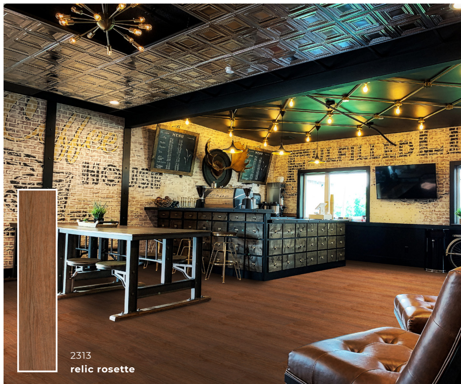
2313 relic rosette