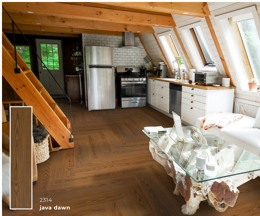
2314 java dawn