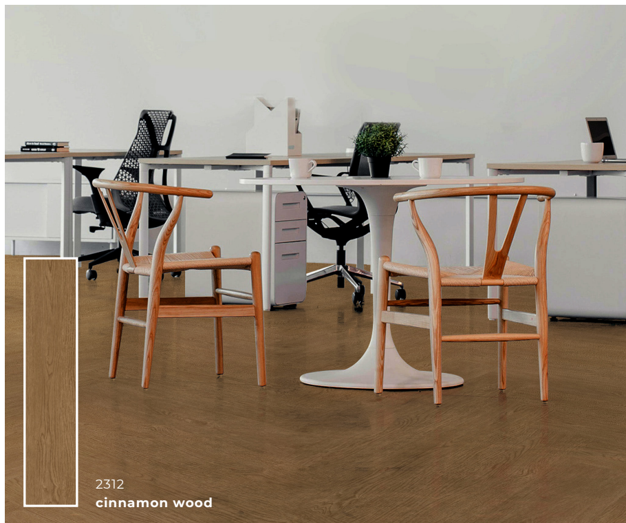
2312 cinnamon wood