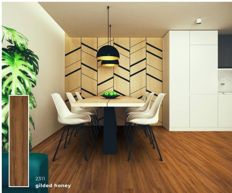
2311 gilded honey