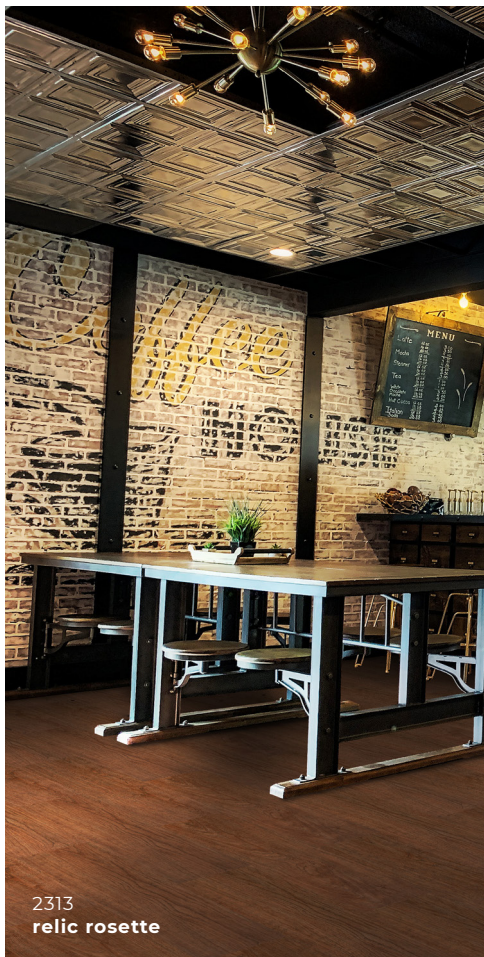
2313 relic rosette